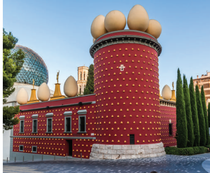
Girona (left) and Teatre-Museu Dalí, Figueres (right)