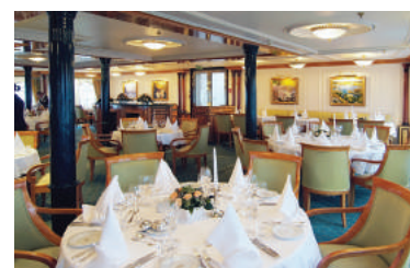
Sea Cloud II Junior Suite (top), Lido Deck (center) and Dining Room (above)

FOR MORE INFORMATION, VISIT ALUMNI.HARVARD.EDU/TRAVEL