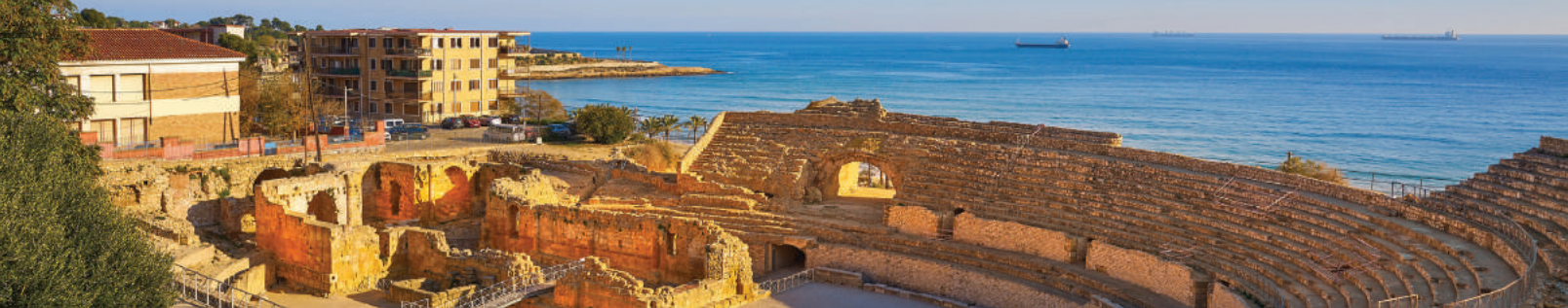
Tarragona Amphitheater, Tarragona (above); Cover: Catedral de Santa María de Palma de Mallorca, Palma de Mallorca