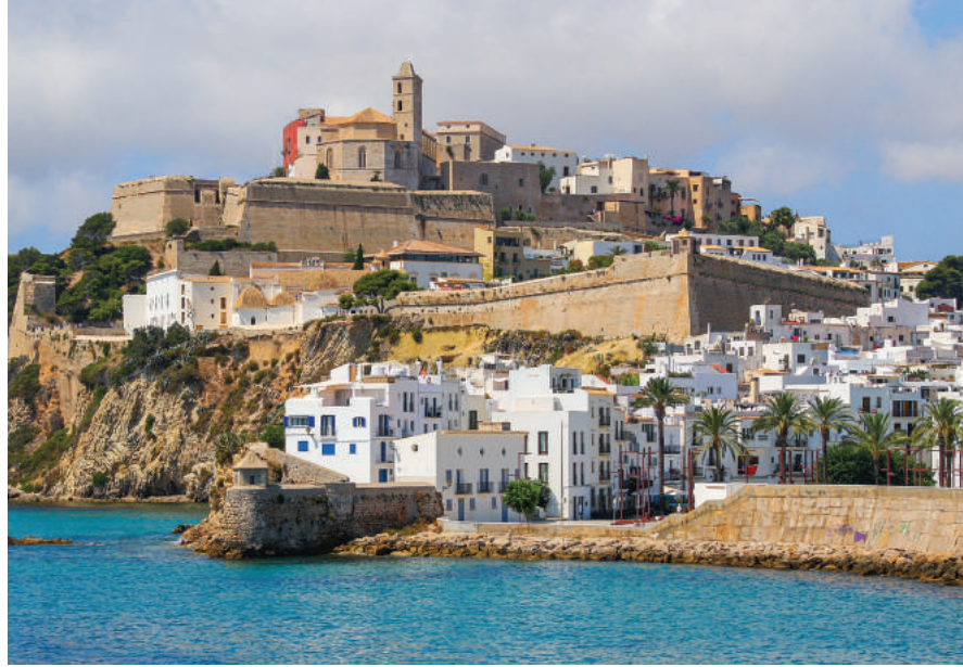
Mercado Central, Valencia (left) and Dalt Vila, Ibiza Town (right)

You will also visit the Mercado Central (Central Market), an exemplary showcase of Valencian Art Nouveau, where more than 300 stalls overflow with local delights. See the spectacular Gothic Valencia Cathedral, whose architecture ranges from Romanesque to Neoclassical. Within, visit the Chapel of the Holy Chalice, housing a first-century A.D. cup believed to have touched Christ's lips during the Last Supper. Before returning to the ship, discover the Museo de Bellas Artes de Valencia, Spain's second-largest art gallery, whose collection includes treasures by Velázquez, Goya, and Sorolla. Alternatively, marvel at the futuristic Ciudad de las Artes y las Ciencias, designed by Valencia-born architect Santiago Calatrava, with its six magnificent structures and a distinctive bridge. B,L,D