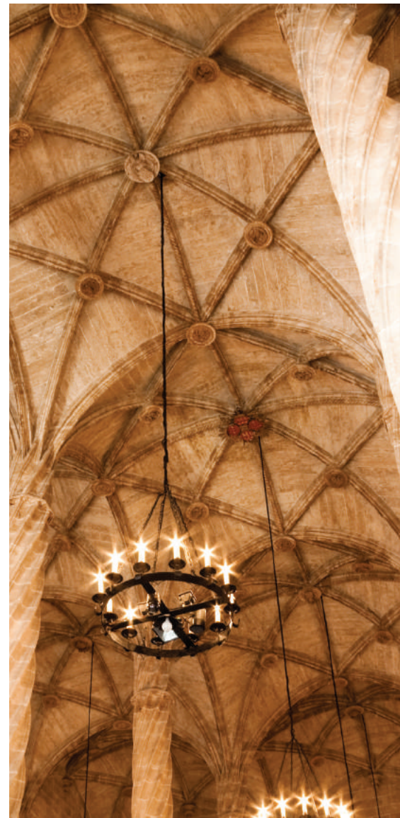
Lonja de la Seda, Valencia (above)

Disembark Sea Cloud II upon return to Tarragona this morning and transfer to the Barcelona airport for your flights home. B