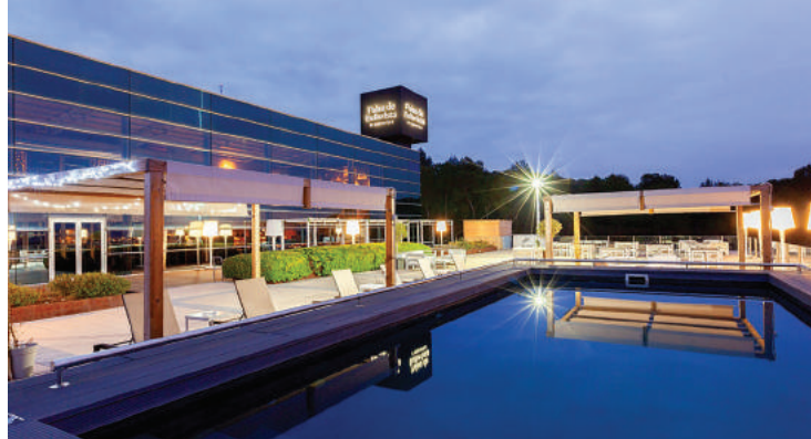
Hotel Palau de Bellavista Girona

This elegant hotel sits in a quiet corner next to Girona's Jewish quarter and Barri Vell (the historic old town). Combining chic design with impeccable service, the Hotel Palau de Bellavista features great views from the hotel's roof terrace as well as a bar and a pool.